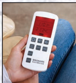
Rhino R420 units include FREE Bonaire Programmable Remote Navigator Control