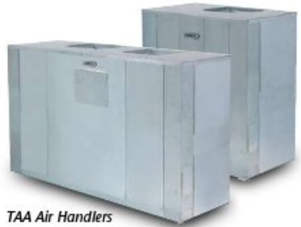
TAA Air Handlers